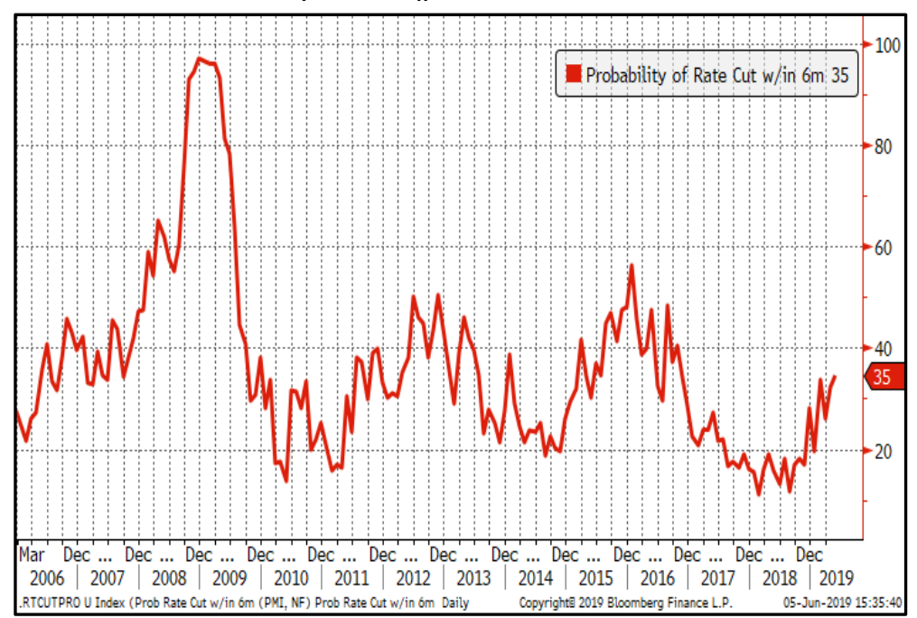
Chart 2: Current Level of Activity Not Pointing to Near-term Rate Cut

justify a policy reversal back into easing mode. With the next FOMC meeting taking place in mid-June, there will be little if any hard data for the Fed to point to showing damage to the economy from current trade policy measures. From there, however, expectations investor jump considerably: market-based probabilities of a rate cut go from 23% at the June meeting to nearly 68% by July (they continue to rise the further out we go, reaching nearly 100% probability multiple cuts by year-end). The current economic data, however, implies a much lower probability: looking at a key gauge of U.S. manufacturing activity (the National Association Purchasing Managers' PMI index) as well as the strength of the labor