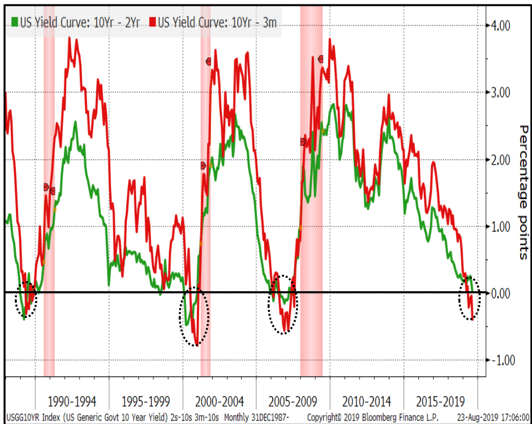
Chart 1: Inverted Yield Curve Historically a Good Predictor of Recession

Although the spread between the US 10-year Treasury and 3-month T-Bill turned negative back in May, the slope of the curve between 10-year and 2-year bonds managed to remain positive before just barely going negative in mid-August. While the presence of a so-called "inverted yield curve" has been a very reliable predictor of recession in the past, there are a couple of things to keep in mind as we look to react to these developments. First of all, there's a strong possibility the sharply negative term premium currently evident – a result of years of quantitative easing and strong investor demand for safe haven assets – may be artificially depressing the longer-end of the yield curve (and, thus, its slope), triggering an inversion sooner than would otherwise be the case. Even if we assume a timely signal, however, there has, on average, been a gap of roughly 18 months between the time the curve inverts and the onset of recession, leaving us with our standing view that we are unlikely to actually see recession until some time in 2021.